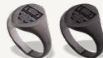
Black Rhodium Plating +£25 or Black Ruthenium Plating +£50 Available on all items