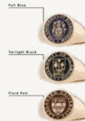
Enamel Finish +£30 Available on Signet and Band Rings