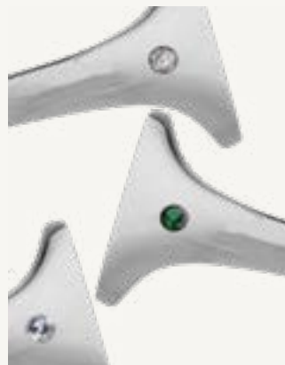
Diamond or Gemstone Set Sides +£120 Available on Signets, Seals and Imperial Rings

The Bespoke service offers customers the freedom to create an even more unique ring, specific to their personal style. We explored our archive of original requests and have put together this collection of Bespoke options to choose from.